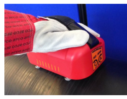
High liftoff probe

and inspecting them with the high liftoff probe. One tool was designed to scan axially (to determine the position of the weld), while the other was designed for circumferential scanning (to fully inspect the circumferential welds).